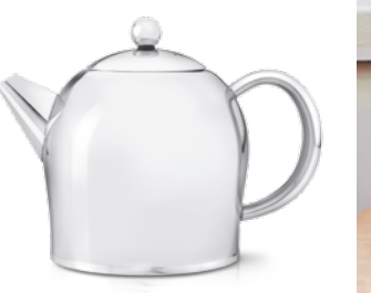
Santhee - polished

The double wall construction ensures that the temperature and flavour of the tea are retained for an extra —long period of time!—